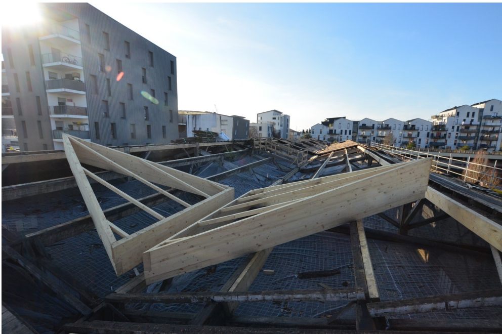
Views of the construction site