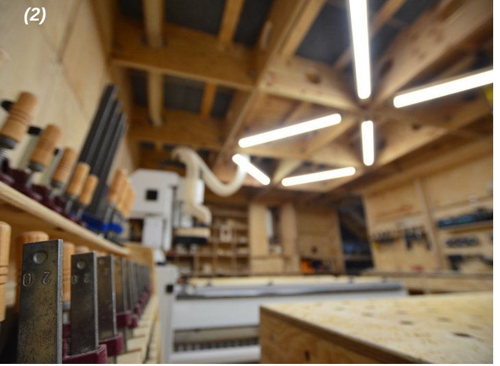
Workspaces – (1) at construction site and (2) temporary location